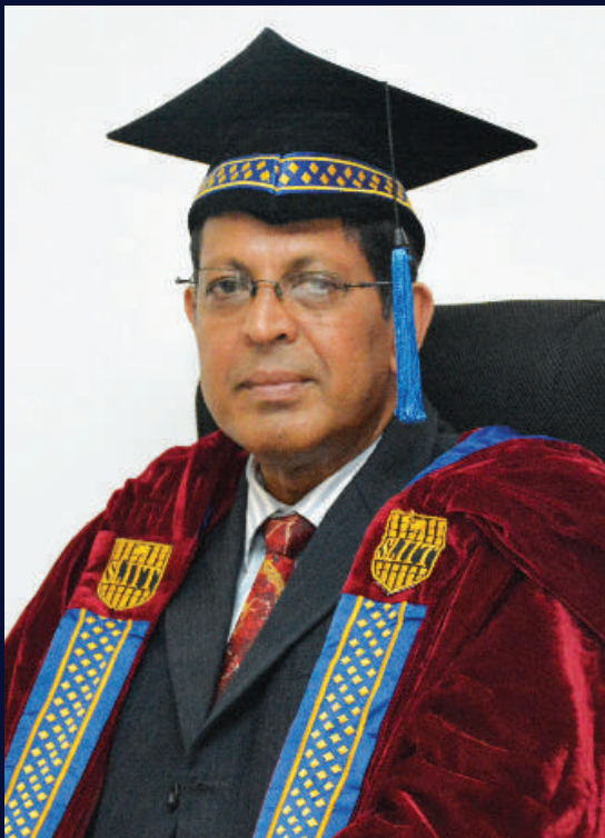
Professor Rahula Attalage Pro Vice - Chancellor (Academic)

The Faculty of Graduate Studies is the recently restructured version of the Faculty of Graduate Studies and Research which was established in 2002 with the concurrence of the UGC in order to foster the development of Graduate studies and Research-related activities falling in-line with the vision of the Institute. During a relatively short period, the Faculty gained momentum with necessary ingredients to initiate a research culture and to provide a conducive platform for the graduate students and academic staff to engage themselves in carefully planned research & development activities.